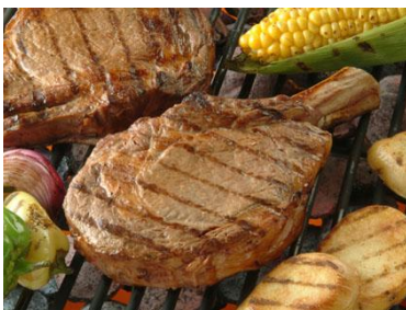
12-oz rib eye, baked potato, corn on the cob, baked beans