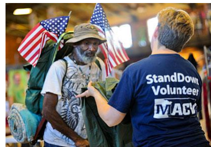
VA Photo by April Eilers

One of the driving forces behind the Chicago Stand Down is Illinois VFW State Homeless