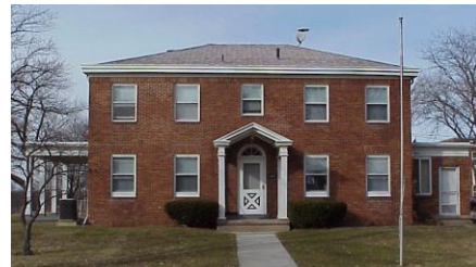
Illinois 1 House Constructed in 1929 / 2,874 sq.ft. 4 bedrooms, 2 baths

The VFW Department of Illinois and its Ladies Auxiliary sponsor two homes on the campus. Our Post's Ladies Auxiliary helps maintain the interiors of both homes and the Post's donations to the homes help maintain the outside of each.