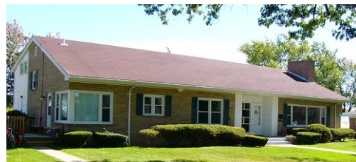
Illinois 2 House Constructed in 1959 / 3,850 sq.ft. 4 bedrooms, 3 baths (1 in the basement)

To learn more about the VFW National Home for Children, visit www.vfwnationalhome.org or call 866-4VFWNHC.