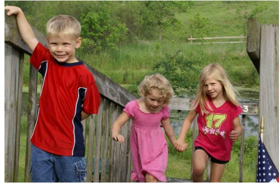
Heading to the Scout Cabin to register for the Fishing Rodeo held on the campus

The VFW Department of Illinois and its Ladies Auxiliary sponsor two homes on the campus. Our Post's Ladies Auxiliary helps maintain the interiors of both homes and the Post's donations to the homes help maintain the outside of each.