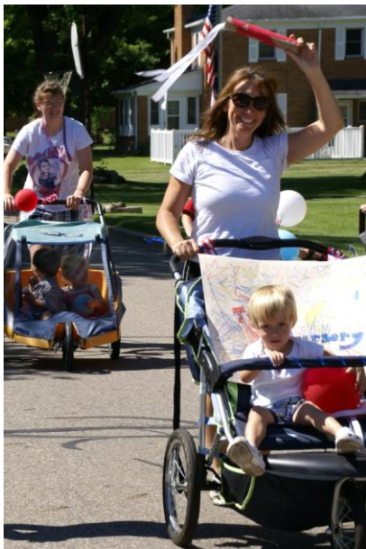
Fourth of July 2011 Bike Parade

The National Home Helpline (800-313-4200) is staffed by dedicated professionals who work directly with callers from anywhere in the country to help them and, if needed, be their advocate to find solutions to their pressing issues and concerns.