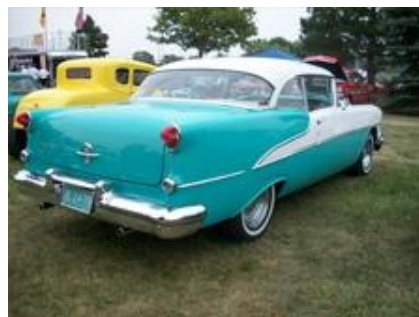
One of the many vintage autos at the Car Show